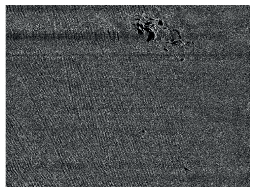
Fig. 3. A side-scan sonar image in the Western Approaches to the English Channel showing furrow lines cut by a scallop dredge boat through a rare shipwreck of c. 1670-90 (Odyssey site 35F). At a depth of 110m,[2]

Commons Petition to King Edward III of England complained about a newly introduced fishing gear, the 'wondyrechoun', a "three fathoms long and ten of men's feet wide" state-of-theart device[3].