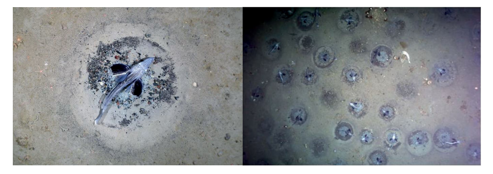
Fig. 1. Photograph of nesting grounds of Jonah's icefish ( Neopagetopsis ionah ) discovered under sea cover of Weddell Sea Alfred Wegener Institute January 14, 2022. (https://scitechdaily.com/spectacular-discovery-in-antarctica-massive-icefish-breeding-colony-with-60-million-nests/)

The direct reason for this paper was appearance of the photograph of nesting grounds of Jonah's icefish (Neopagetopsis ionah) discovered recently under sea cover of Weddell Sea. This colony of icefish is the largest found to date, stretching across more than 150 miles (240km) of the seabed. The sheer size of the colony 60million-nests suggests the whole Weddell Sea ecosystem is influenced by these nests. The images show active fish parents that bild nest and take care for their roe. At the same time the author was investigating means of detailed imaging of sea-bottom features. Studies of old wrecks are examples of such activity. Example images of such sites (fig. 4) are really horrifying while put aside to images of Jonah's icefish nesting grounds. Without explanation it is difficult to guess what we see on the fig. 2. I fact it is side scan image of the wreck site. Parallel lines on the image illustrate extent of local fishing activity and magnitude of physical influence to sea bottom caused by this activity. Simply say-