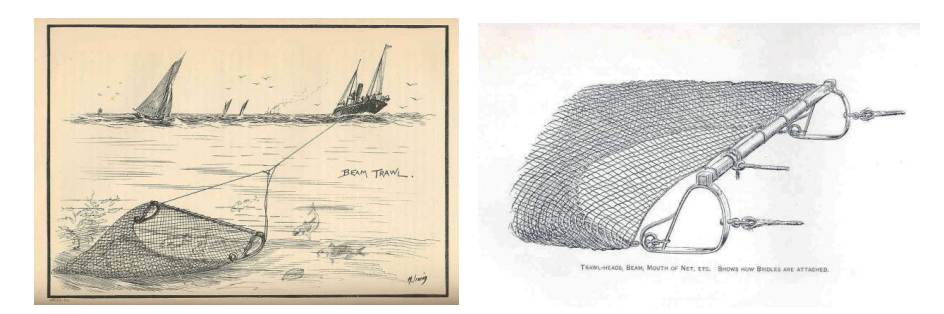
Fig. 5. Bottom beam trawling by sailing trawler around year 1850[4]. Till year 1980 weight of the trawling gear increased to 30 tons[5].

Fig. 4. A ceramic cargo fallen on one side on a mid to late 19th-centurywooden shipwreck (Site 2T11w24b-1; Target 581). The top edges of the plates have been 'shaved' by a trawler/dredge. Atlas shipwreck survey zone, depth 124.0m.[3]