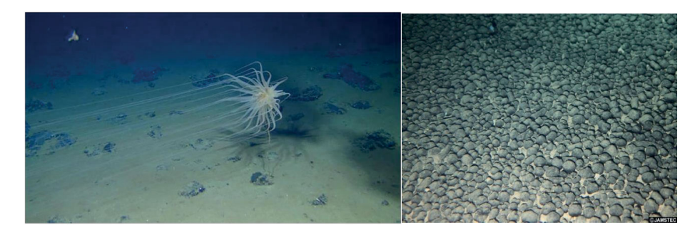
Fig. 2. Left: A species of cnidarian in the genus Relicanthus with 8-foot long tentacles attached to a dead sponge stalk on a nodule in the eastern Clarion-Clipperton Zone. These are closely related to anemones [1], Right: Sea bottom covered by manganese modules and invisible layers of bacteria appears as life-less gravel Location: At the Godzilla Mullion in the Parece Vela Basin May 16, 2009 [https://www.jamstec.go.jp/gallery/e/geology/resource/003.html].

ing, the bottom was deeply ploughed. One can guess the image of nesting grounds of Jonah's icefish if they would not be protected by thick ice. While archeological sites are not usually protected by thick ice cover, they are exposed to damage by fishing activity. In fact majority of sites are badly damaged. Substantial part of human heritage was destroyed this way already. However after being discovered, wreckage remaining are usually studied for many years ad offer quantitative information regarding processes of destruction of both archeological artifacts and surrounding environment.