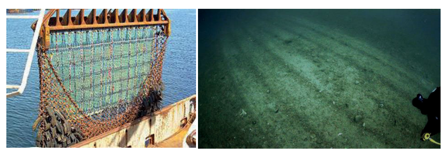
Fig. 6. Left: A scallop dredge [6], Right: Result of application of a scallop dredge to bottom environment [7],

Fig. 5. Bottom beam trawling by sailing trawler around year 1850[4]. Till year 1980 weight of the trawling gear increased to 30 tons[5].