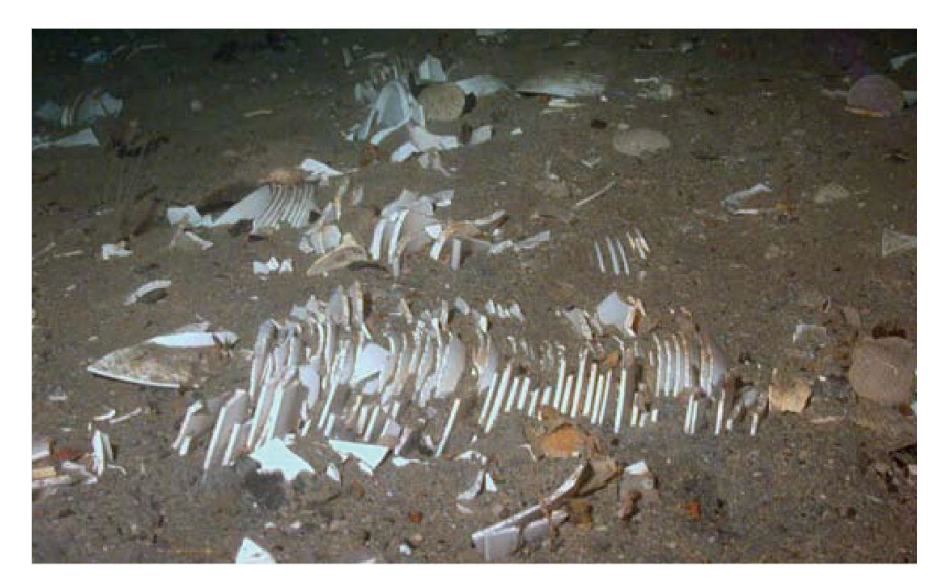
Fig. 4. A ceramic cargo fallen on one side on a mid to late 19th-centurywooden shipwreck (Site 2T11w24b-1; Target 581). The top edges of the plates have been 'shaved' by a trawler/dredge. Atlas shipwreck survey zone, depth 124.0m.[3]