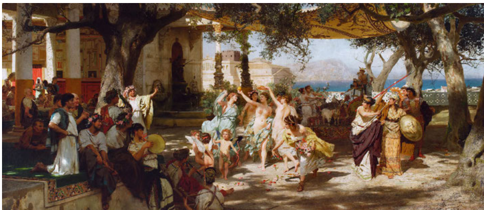
IV. Henryk Siemiradzki, The Judgment of Paris or The Triumph of Venus , 1892, oil on canvas, 99 × 227 cm, National Museum, Warsaw.