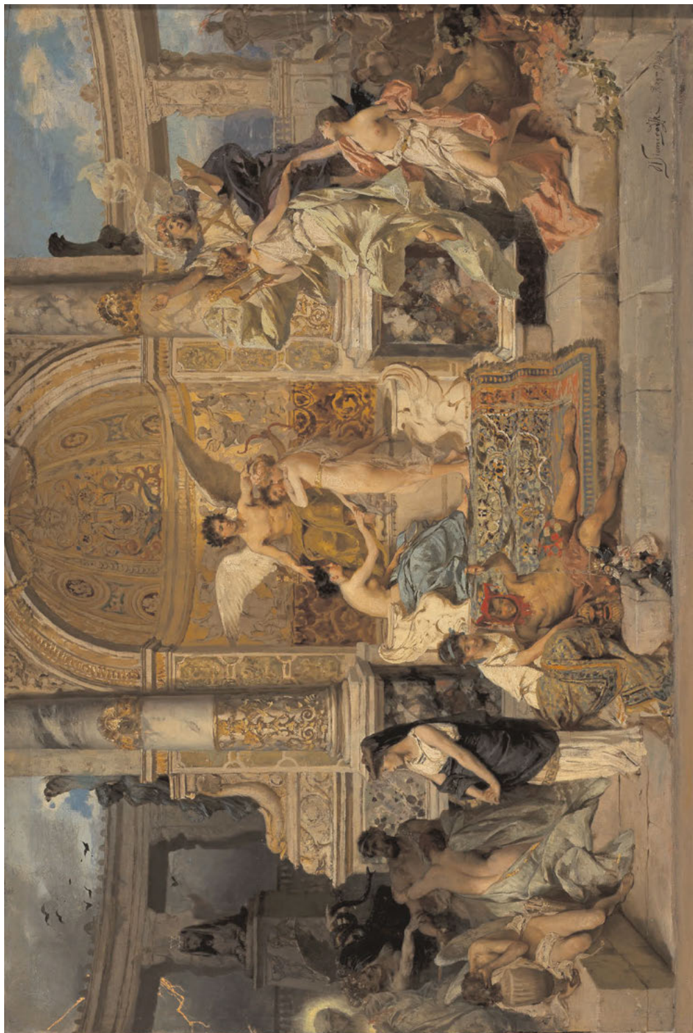
VII. Henryk Siemiradzki, Curtain for the Kraków Theatre (the Juliusz Słowacki Theatre), 1894.