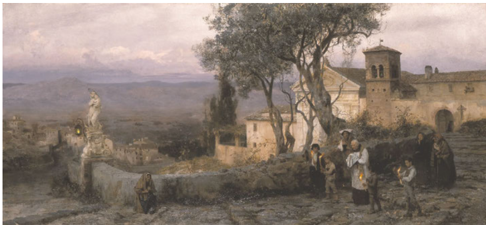
IX. Henryk Siemiradzki, With the Viaticum , 1889, oil on canvas, 60 × 131 cm, National Museum, Warsaw.