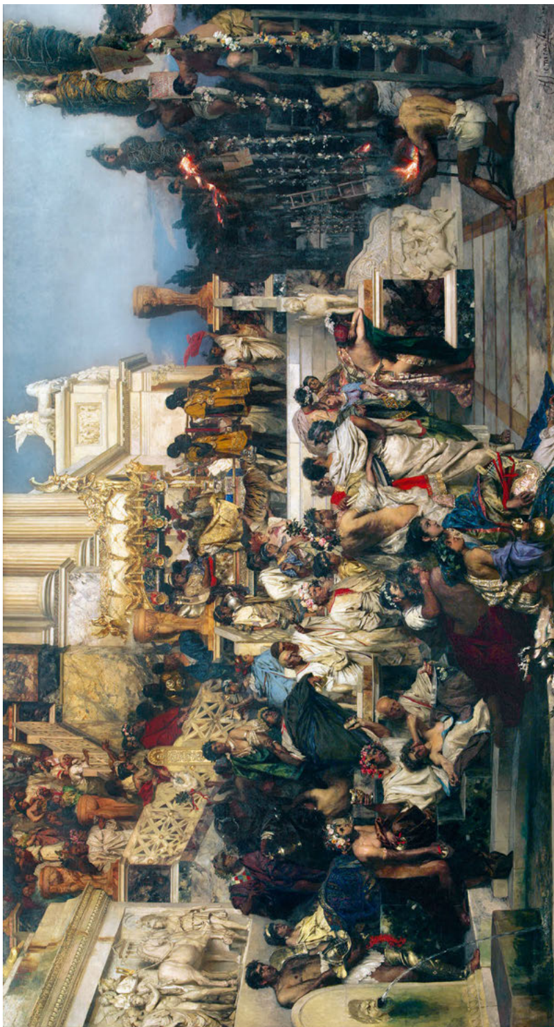
II. Henryk Siemiradzki, Nero's Torches , 1876, oil on canvas, 385 x 705 cm, National Museum, Krakow.