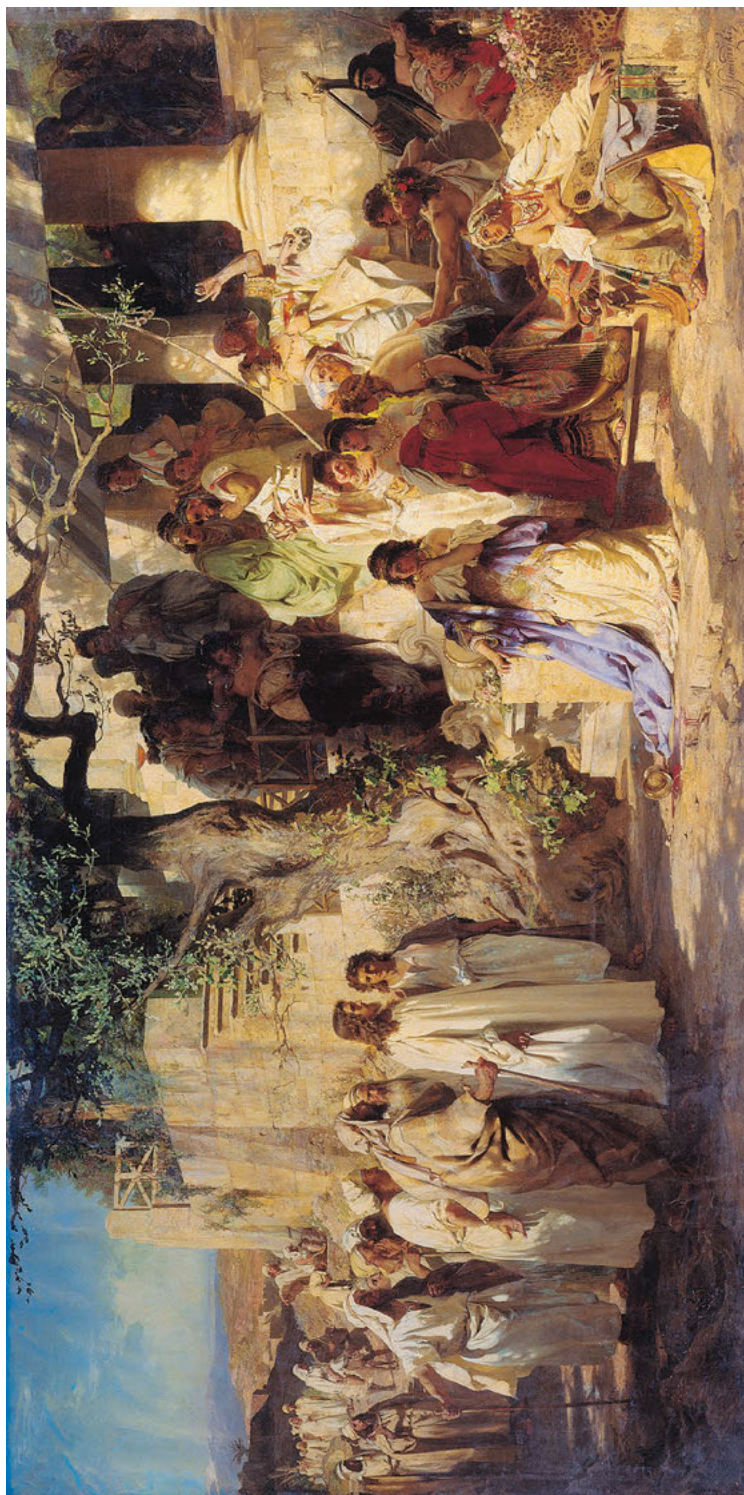
I. Henryk Siemiradzki, Christ and the Harlot , 1873, oil on canvas, 250 x 499 cm, State Russian Museum, St. Petersburg.