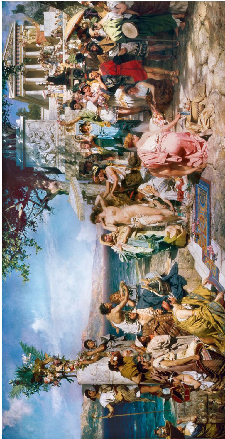
III. Henryk Siemiradzki, Phryne at the Festival of Poseidon in Eleusis , 1889, oil on canvas, 390 × 763.5 cm, The State Russian Museum, St. Petersburg.