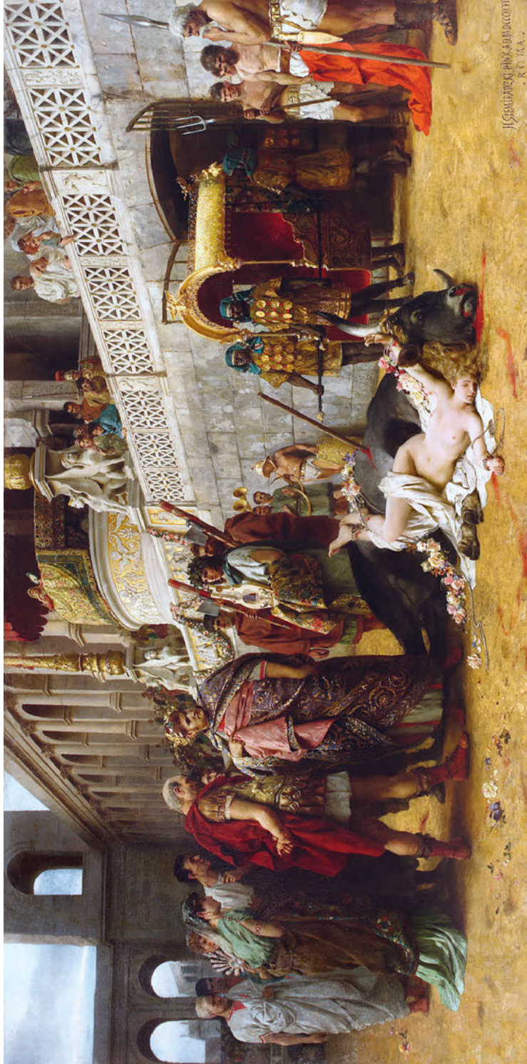
VI. Henryk Siemiradzki, Christian Dirce , 1897, oil on canvas, 263 x 530 cm, National Museum, Warsaw.