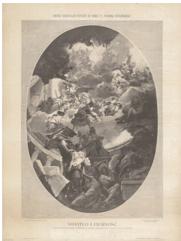
X. Andrzej Zajkowski after Józef Buchbinder, Light and Dark . Plafond by Henryk Siemiradzki in the vestibule of the palace of Jan Zawisza in Warsaw, 1884, wood-engraving, Iconographic Resources, G.61226, National Library, Warsaw.