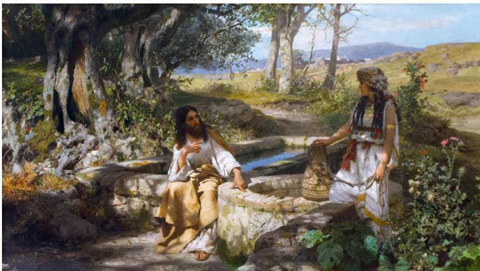
V. Henryk Siemiradzki, Christ and the Woman of Samaria , 1890, oil on canvas, 106.5 x 184 cm, Lviv National Gallery of Arts.