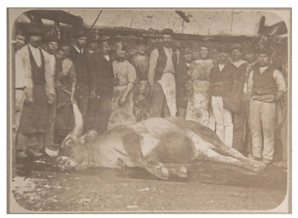
79. Augusto Arrighi, Roman slaughterhouse, National Museum, Krakow, no. inv. MNK XX-f-27030.