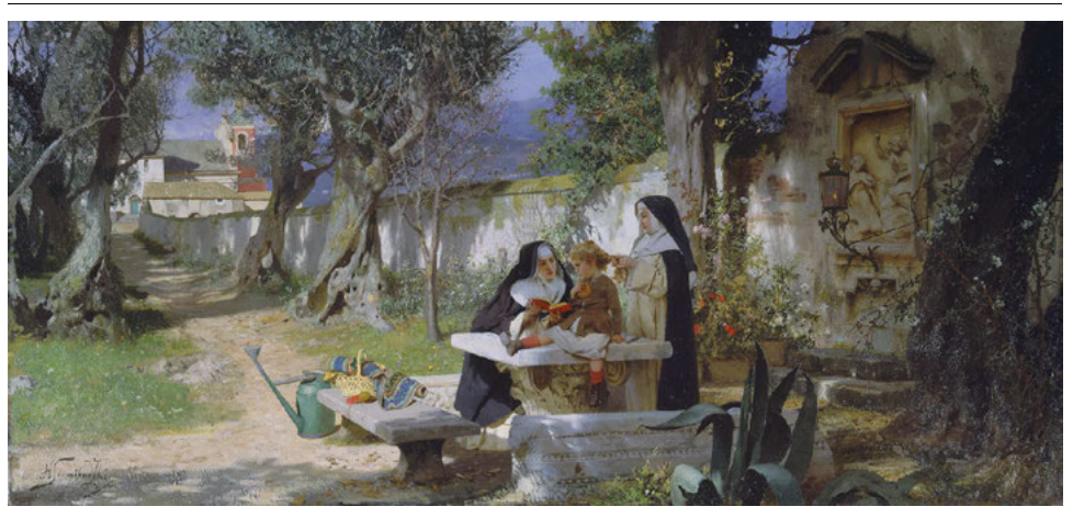
64. Henryk Siemiradzki, In the Silence of the Cloister , before 1891, oil on canvas, 60 \times 130 cm, private collection. Photo collection.