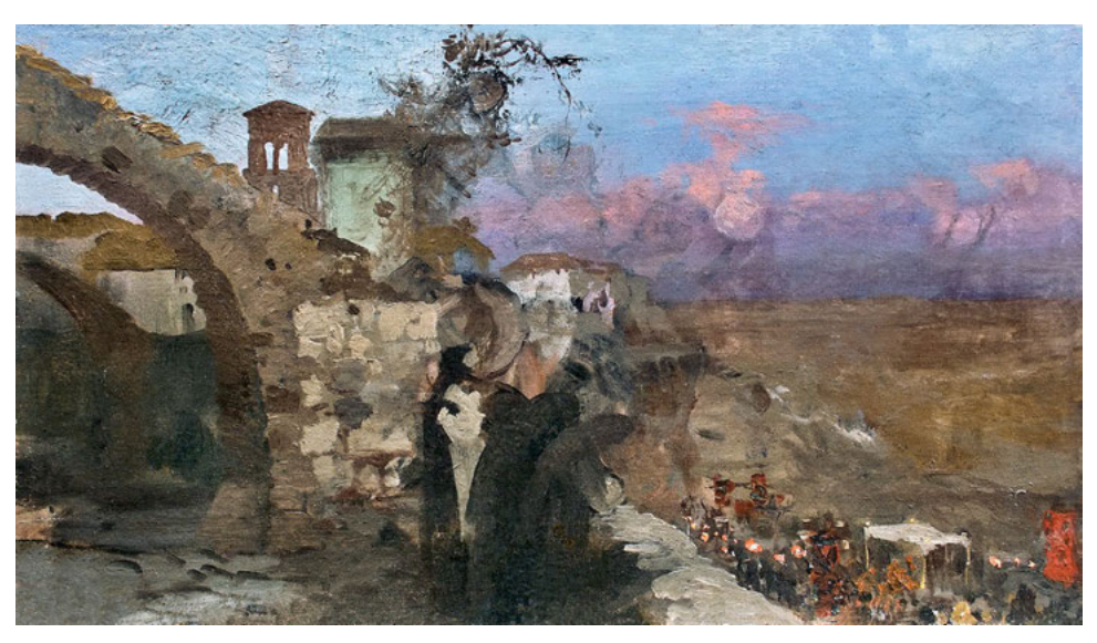
65. Henryk Siemiradzki, Procession , 1880s, a sketch for an unproduced composition, oil on canvas, 24 \times 42 cm, private collection.