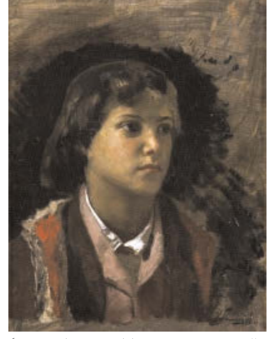
61. Henryk Siemiradzki, A Mountain Dweller from the Sabine Hills , ca. 1889, oil on canvas, 41.3 × 31.5 cm, private collection.

60. Henryk Siemiradzki, An Italian Landscape with a Donkey on a Road , 1880s, oil on wood, 26.6 \times 36 cm, National Museum, Warsaw.