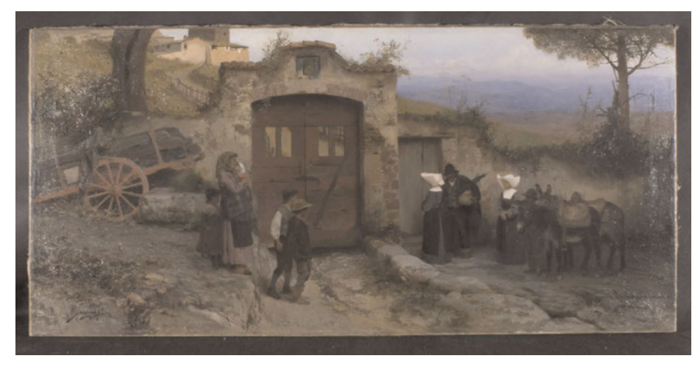
63. Henryk Siemiradzki, With Consolation and Relief (With Comfort and Assistance), ca. 1885, oil on canvas. 57 \times 118.7 cm, private collection.