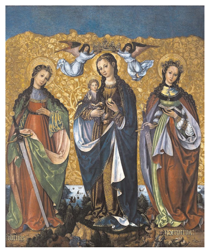
35. Painter from the circle of the Master of Triptych from Warta, Mary with Child and Saints Felicity and Perpetua, ca. 1520, tempera on wood, 163 × 132 cm, National Museum, Warsaw.