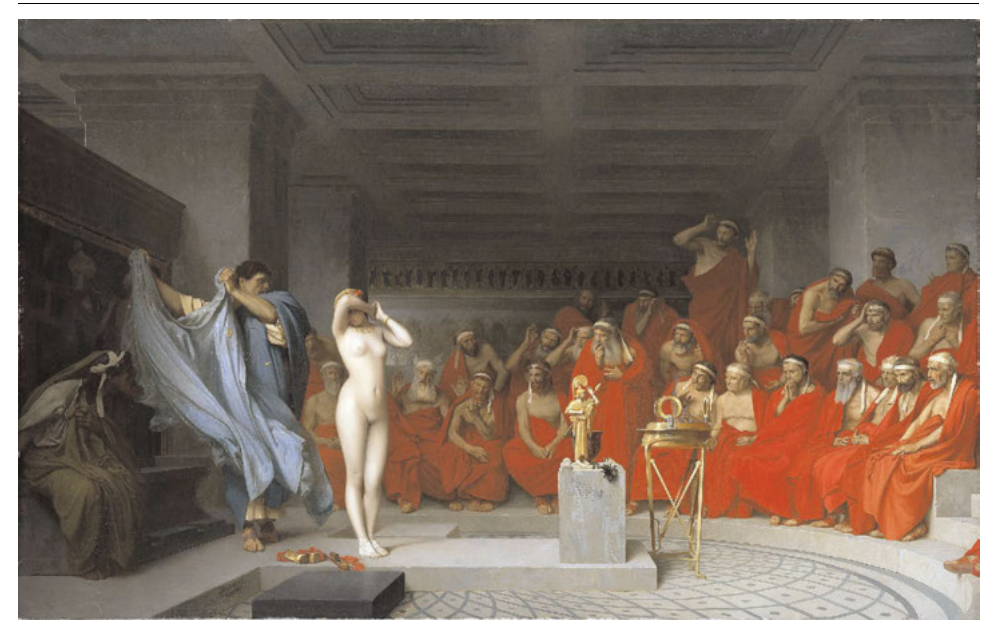
32. Jean-Léon Gérôme, Phryne before the Areopagus, 1861, oil on canvas, 80.5 × 128 cm, Hamburg, Hamburger Kunsthalle. Photo in public domain.

PROGRAMME RELATED CONTENT IN THE JUDGMENT OF PARIS BY HENRYK SIEMIRADZKI