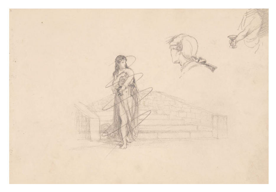
29. Henryk Siemiradzki, Sketches for Christ and the Harlot and for French Artist of the Times of Louis XV paints the Portrait of the Marquise , pencil, paper, 20 × 28.5 cm, National Museum, Krakow, no. inv. MNK III-r.a.-18401/9.