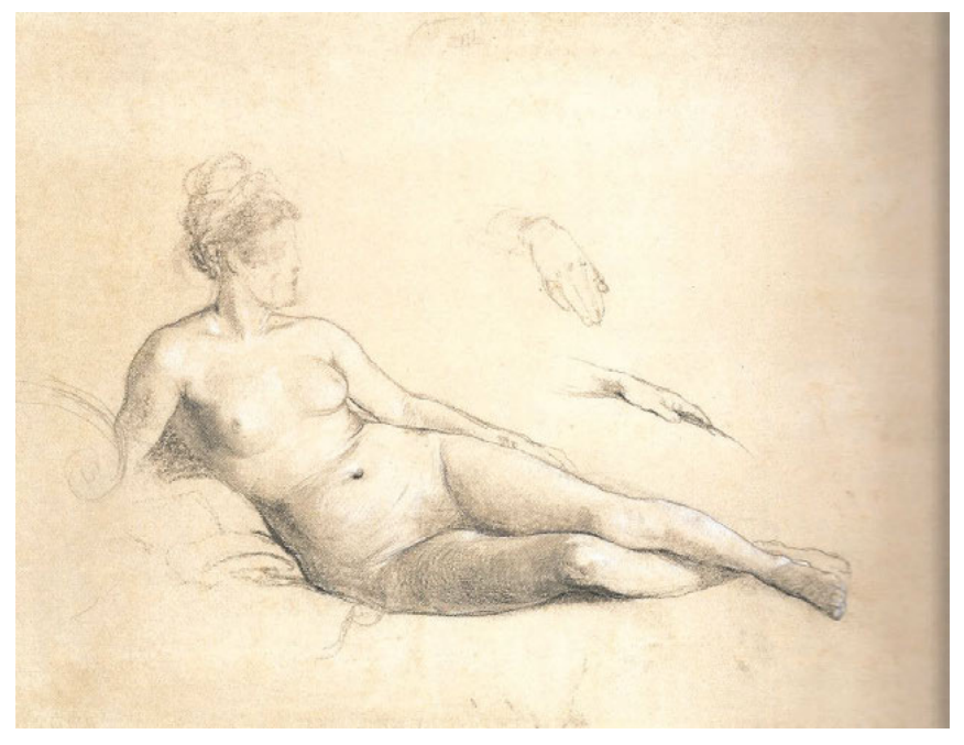
27. Henryk Siemiradzki, Reclining Nude (the Model), sketch, pencil, charcoal, chalk, yellow paper, 35.8 × 44.2 cm, National Museum, Kiev Fine Art Gallery.