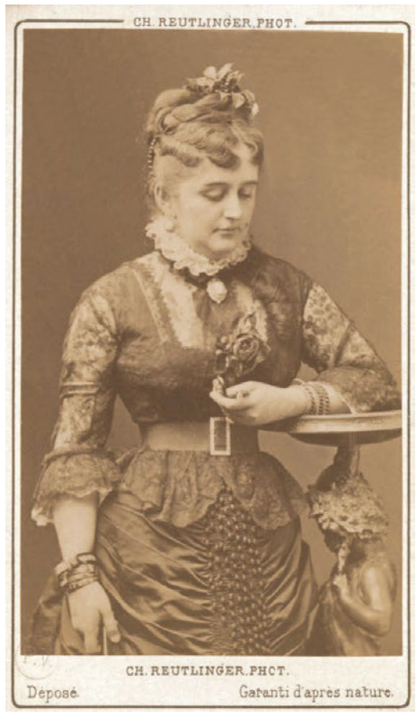
30. Charles Reutlinger, Photograph of Fanny Lear. Photo in public domain.