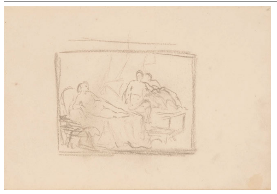
28. Henryk Siemiradzki, sketch for A French Artist of the Time of Louis XV paints the Portrait of a Marquise , pencil, paper, 20 \times 28.5 cm, National Museum, Krakow, no. inv. MNK III-r.a.- 18401/15.