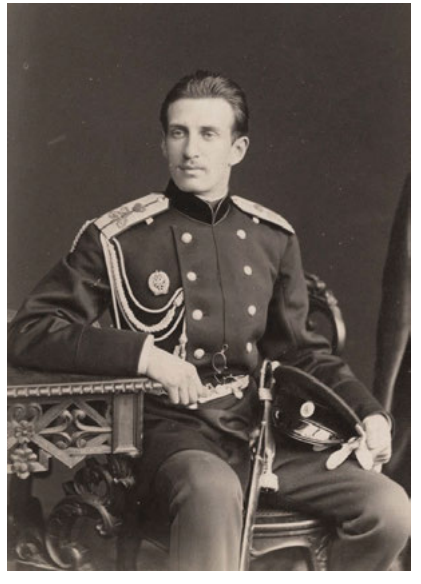
24. Charles Bergamasco, Photograph of Grand Duke Nicholas Konstantinovich Romanov, 1874. Photo in public domain.