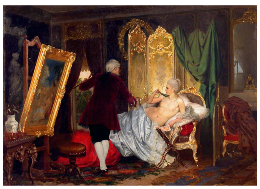
23. Henryk Siemiradzki, A French Artist of the Time of Louis XV Paints the Portrait of a Marquise (The Studio of a Fashionable Artist of the 18<sup>th</sup> Century), 1871, oil on canvas, 75.5 × 103 cm, State Art Museum of Uzbekistan, Tashkent.