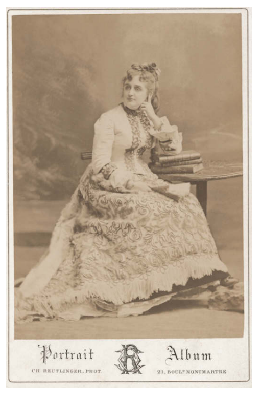
31. Charles Reutlinger, Photograph of Fanny Lear. Album. Photo in public domain.