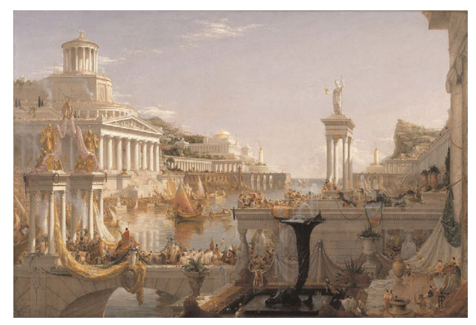
7. Thomas Cole, Consummation of Empire , 1836, oil on canvas, 130.2 \times 193 cm, Historical Society, New York. Photo in public domain.