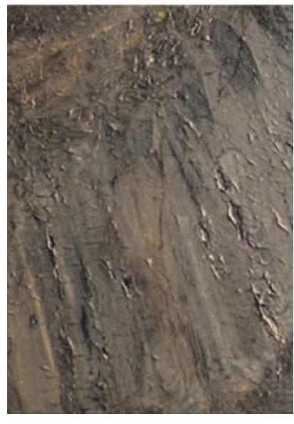
Girl in a picture frame, overpainting on the dress, Warsaw Royal Castle - Museum

From the earliest decades the pictures were restored many times. The original varnishes were removed, possibly even during Rembrandt's lifetime. The frequent relocations, reframings, and changes of format inevitably caused damage, which thus required restoration. During the early renovations the originals were partially overcleaned and thereafter overpainted. Fortunately, the paint layers in most areas of both portraits are well preserved, with the exception of the red dress in the girl's portrait. Here the paint layer developed a prominent,