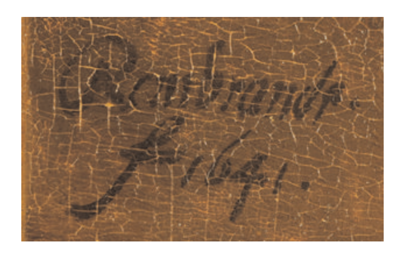
Rembrandt's signature on Scholar at His Writing Table , Royal Castle in Warsaw – Museum.

The pigments, ground components, and binding media, as well as