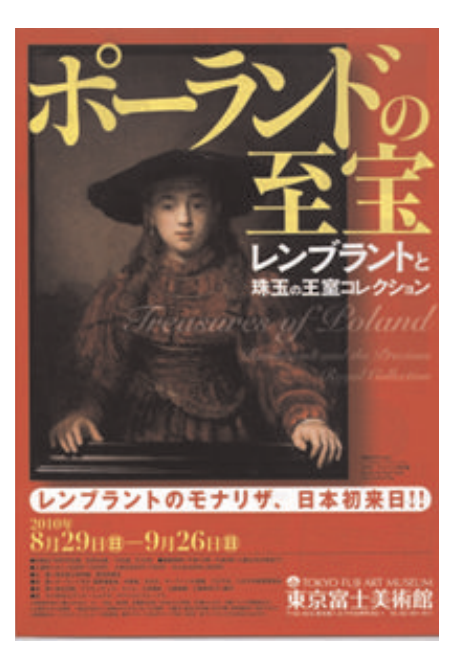
Poster for the Japan exhibition, Tokyo Fuji Art Museum, 2010

at the heart of a new permanent display, "The Lanckoroński Collection - Rembrandt's Paintings".