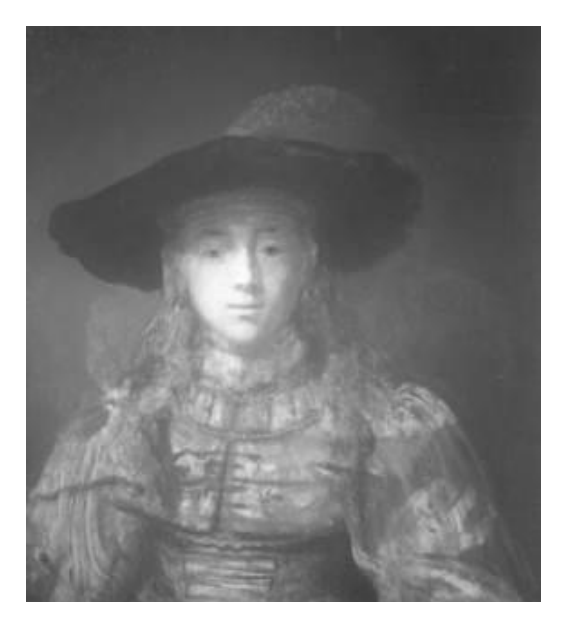
Girl in a picture frame, IR image, Warsaw Royal Castle - Museum

IR and X-ray examinations of the Girl revealed the sketch of another portrait beneath the present image. This abandoned work depicted a woman in three-quarter profile, possibly in a white ruff and coif. The silhouette is delineated with dark brushstrokes: its outline was slightly visible even to the naked eve prior to the treatment owing to the naturally increased transparency of the upper paint layers. In the Scholar only minor pentimenti were detected, in the lower part of the outline of the cap and along the right profile of the figure.