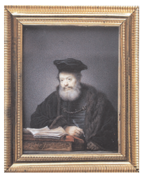
Lesseur, Portrait of a Young Woman with Her Hands on the Sill, Scholar at His Writing Table , 1797, watercolor and gouache on ivory, 124 x 84 mm and 125 x 93 mm, Polish Museum in Rapperswil, Rapperswil.

of the background. This may have been due to an issue with the original signature that is now unclear.