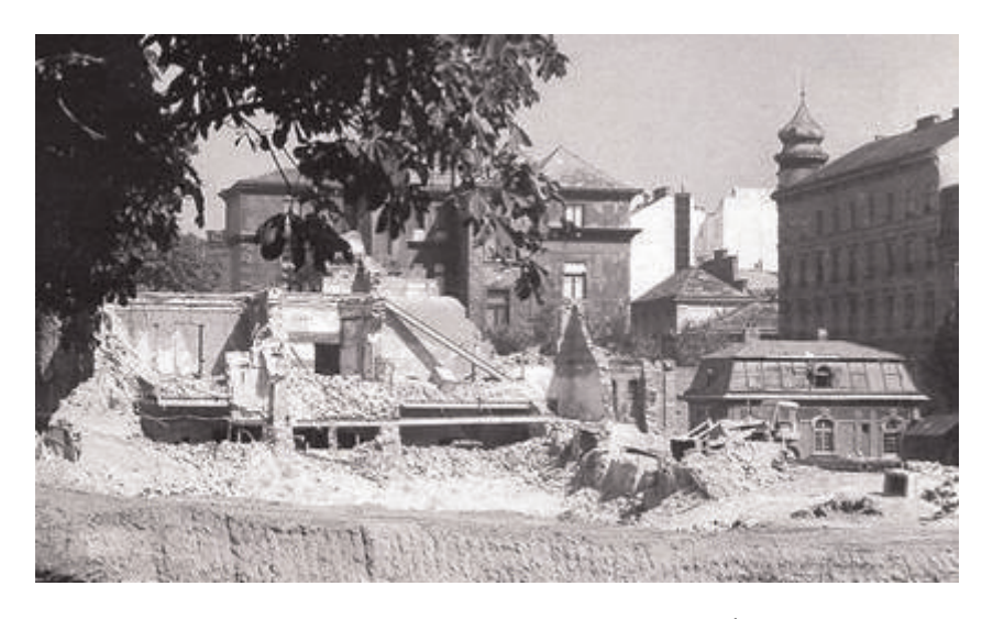
Ruins of the Lanckoroński Palace, photo, c. 1960, Vienna, after J. Winiewicz-Wolska

After World War I, when Poland regained its independence following 123 years under the partitions, the Lanckoroński family planned to move their collection to their native land. After much effort they finally obtained the necessary permission from the Austrian authorities, but before the works could be moved, World War II broke out. The core of the collection, including the two Rembrandts, was confiscated by the Germans in 1943–1944 and impounded in a mine in Altaussee near Salzburg, which was used as a storage depot for art plundered from across Europe. On 8 May 1945 the panels were taken from the mine by American troops and on 24–26 May they were deposited at the Central Art Collecting Point in Munich. They were returned to their rightful owners in 1947, but because the Vienna palace had been destroyed near the end of the war, the collection was housed in Hohenems castle, near Vaduz, in Vorarlberg. In 1950 a fire broke out in the castle and many of the paintings were lost. The collection was widely believed