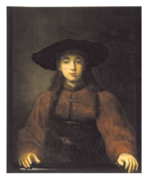
Young Woman with Her Hands on the Picture Frame, after 1641, oil on canvas, 97.2 x 81 cm, The Statens Museum for Kunst, Copenhagen

according to the description on it.8 It was a mezzotint probably made after the painted copy described above, which was indeed believed, until recent decades, to be by Rembrandt himself. The image of the figure is well depicted but there are some differences in her dress and the background. One curious variance is that the black wooden frame has been replaced by a light stone niche with an inscription in French beneath it.