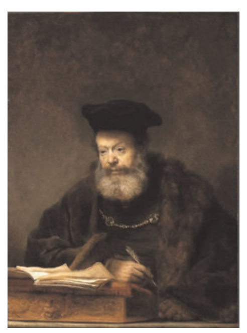
Rembrandt van Rijn: Girl in a Picture Frame , Scholar at His Writing Table , 1641, oil on panel, 104.5 x 76 cm, The Royal Castle in Warsaw – Museum.

There are no written records regarding the early history of these paintings. At that time it was customary for clients themselves to order the painting support – either canvas or panel; if they did not, the purchase was made by the artist and documented in the commission documentation. This did not happen in the case of these Warsaw panels. They are probably not portraits of specific people but generic depictions of unknown models in a type referred to by the Dutch term tronies . They were painted as study models for students, possibly also with the intention of their subsequent sale. At his home, alongside his studio where he worked with his apprentices, Rembrandt also had a sort of gallery room, where his paintings were on display for potential clients and buyers to view.