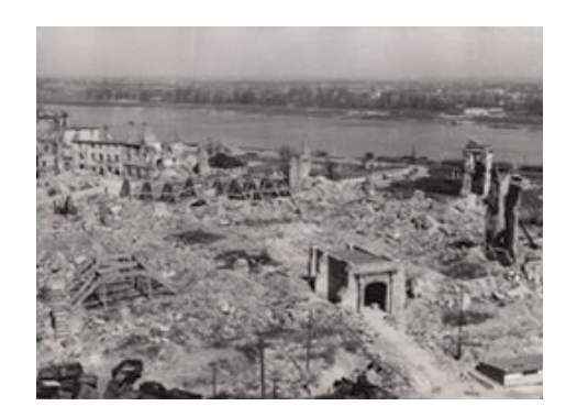
Ruins of the Royal Castle in Warsaw, 1948, photo: Museum History of Warsaw

The return of these Rembrandt paintings to Poland, a country which lost so much of its cultural heritage during the period of the partitions and the two world wars, is of inestimable significance for the Polish nation.