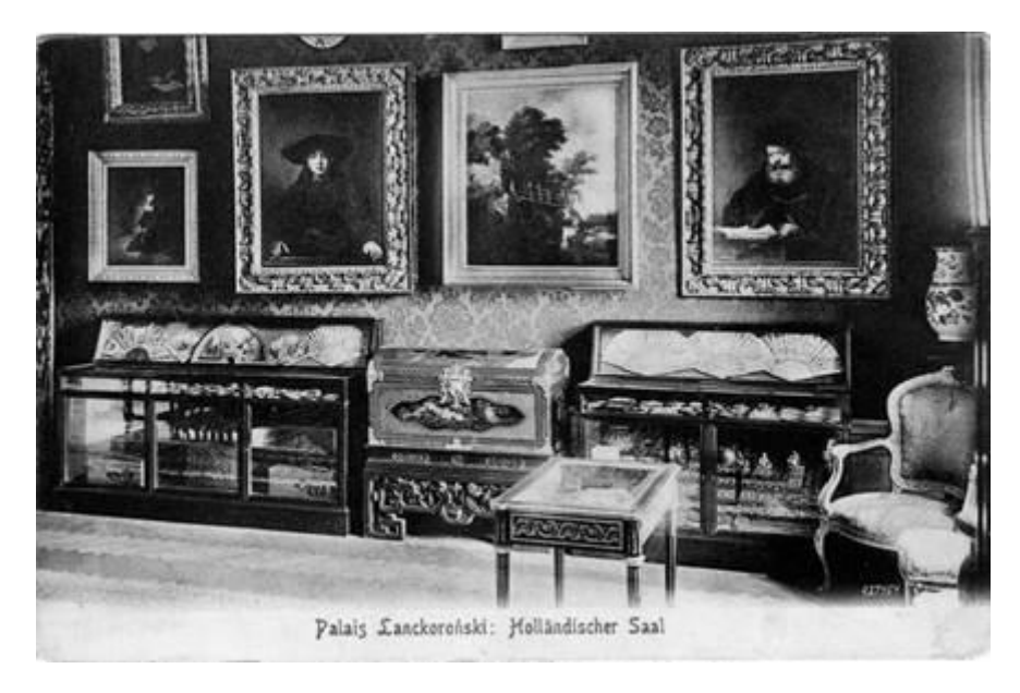
The Dutch Hall in the Lanckoroński Palace, postcard, early years of the 20<sup>th</sup>c., The Royal Castle in Warsaw – Museum, Archive.