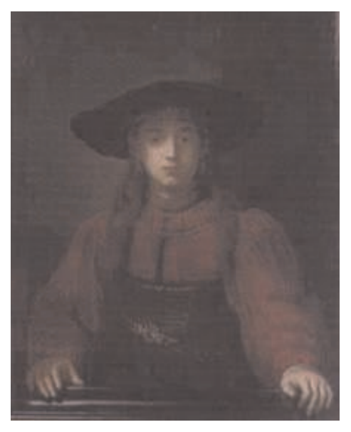
Portrait of a Young Girl, after Refirst half of the 18th c., oil mbrandt, on panel, 104.4 x 79 cm, private collection (Christie's auction, 2011)

The only known panel copy of Girl in a Picture Frame, of nearly identical dimensions to the original, was one that went on sale at a Christie's auction in 2011. The whole image and the facial expression are reproduced well (comparison made on the basis of the