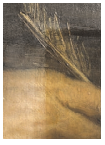
Scholar at His Writing Table, varnish removal Warsaw Royal Castle - Museum

The main aim of the conservation was to clean the surface of the paintings, which had progressively been obscured by dirt, darkened varnishes, and discoloured retouching. Furthermore, the woman's portrait evidently needed structural treatment in the red dress area. Here the varnish underneath the blistered layers of paint had to be removed and replaced with consolidant. The cleaning of the painting's surface revealed extensive repaints on both the figure and the background. It was probably the visibility of the first sketch that necessitated these overpaintings, damages, and restorations. The extensive overpaintings in the upper background, including the added column, and the heaviest layers on the dress, were removed. Several much smaller overpaintings on the face, ears, right earring, hair, necklaces, and belt also needed to be removed. Some overpaints had to be left due to damage to the original paint, or to the impossibility of distinguishing them from the original or of removing them. The surface of the Scholar portrait, which was covered with two layers of old varnish, a number of