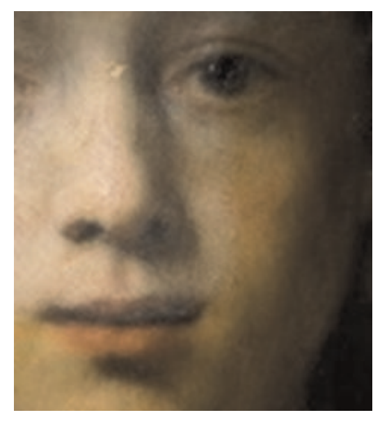
Girl in a Picture Frame, varnish removal Warsaw Royal Castle - Museum