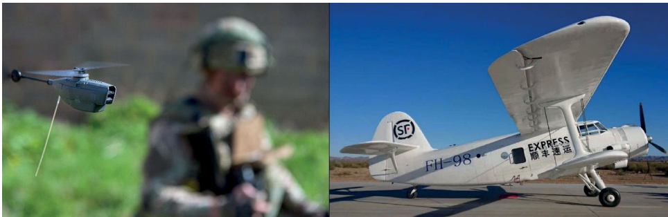
Fig. 1. On the left, the Black Hornet Nano combat drone; on the right, transport drone Feihong-98. You can see the difference in size, weight, construction and purpose of UAVs 12 .

Contrary to stereotypical opinions, most drones do not carry combat payloads and are used only for the collection of intelligence. Therefore the solutions designed for the military are so willingly used by other formations and institutions dealing with e.g. monitoring of national borders, search for missing persons, emergency rescue, observation of weather changes, spread of natural disasters or, precisely, monitoring the condition and ensuring the safety of critical infrastructure. Consequently UAVs are widely used not only in the military but also in the civilian sector, including applications such as recreation, business and industry 11 .