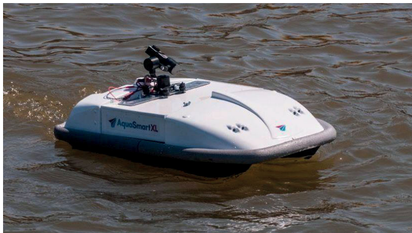
Fig. 4. One of the water (marine) drones used in the Port of Rotterdam, the Netherlands [3]

Despite such serious challenges, the long-term implementation of the Smart Port concept can ensure significant benefits for the port. It is worth mentioning that a number of tasks defined under the smart port concept for air drones will soon be carried out in the Port of Gdynia, thanks to the implementation of KSD. Moreover, in the future, water (marine) drones can interact with aerial drones under the control of KSD (vide: Fig. 4).